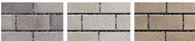
SHALE GREY SRI: 26

Filtration, infiltration, adsorption, volatilization and microbial degradation are among the processes that can occur at different levels in a permeable paving system that reduces total suspended solids (TSS), nutrients, heavy metals and hydrocarbons. The results of the tests carried out on an industrial site in Chambly (Canada) demonstrated that the INFLO permeable pavement system could reduce on average up to 93% of TSS and 77% of total phosphorus from the snow melt water.